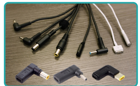
Emulator Adapter Cables

Flex-Share USB-C Charging Stations are adaptable to flexible classroom layouts, device sharing, and more. Best of all, Quick-Sense USB-C saves technicians' time by eliminating AC Adapters. These modular and versatile charging stations can be conveniently mounted to a wall or secured to a desk, made mobile with casters, or stacked! The removable/reversible doors allow for adaptability to the space it is being used in. Flex-Share Stations efficiently charge up to 16 Chromebooks, Tablets, or Notebooks, without having to wire stations with AC adapters.